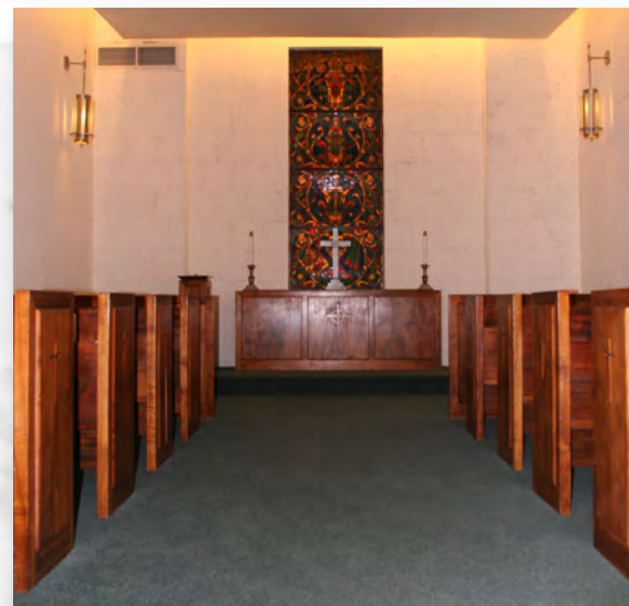
Pilgrim Chapel seats 25 people. Especially appropriate for renewal of vows ceremonies and private weddings.