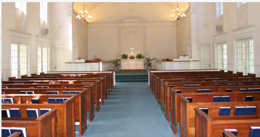
Atherton Memorial Chapel seats 200. There are 11 pews on each side of the center aisle.