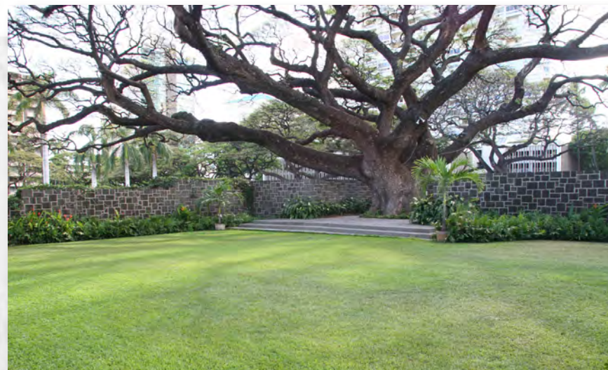
Courtyard of Atherton Memorial Chapel is a walled-in garden that will hold approximately 175 people. Folding chairs are provided for the immediate family. In case of inclement weather, the ceremony may be moved into Atherton Memorial Chapel at no additional cost.