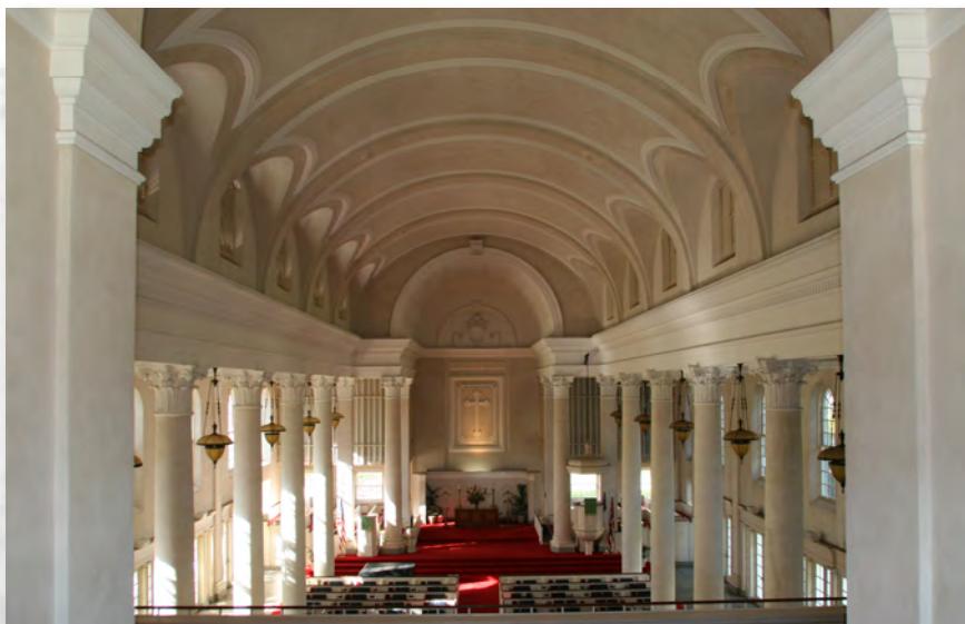
The Sanctuary seats 500 on the main floor and 250 in the balcony. It may accommodate up to 1,000 people. There are 26 pews on one side and 25 pews on the other.